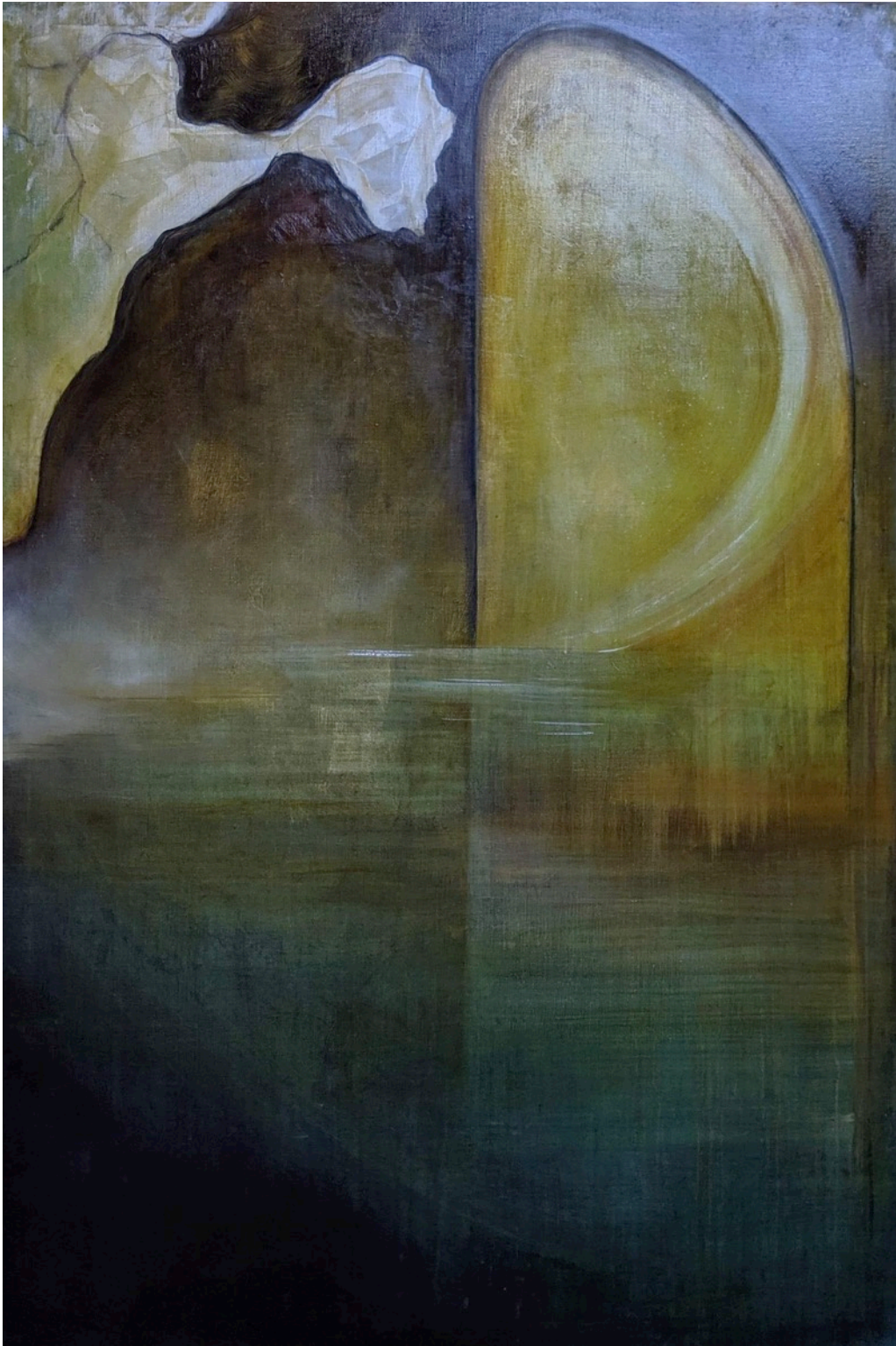
/ Libby Byrne. Odyssey 2019 © the Artist. Image courtesy of the Artist.