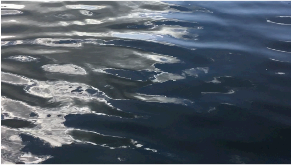
/ Rebekah Pryor. Sealess (video still) 2018 © the Artist. Image courtesy of the Artist.