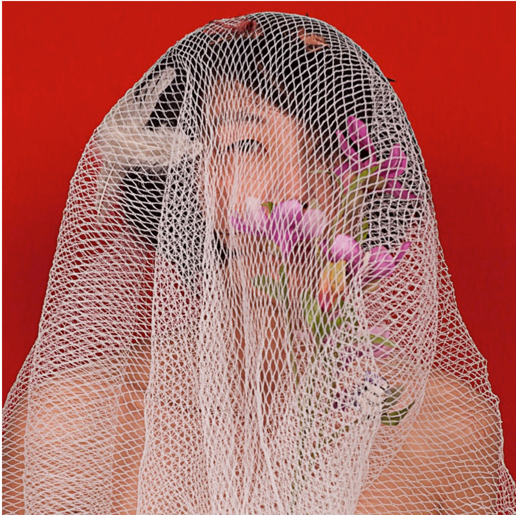
/ Soyoun Kim. Bird Net 2017 © the Artist.