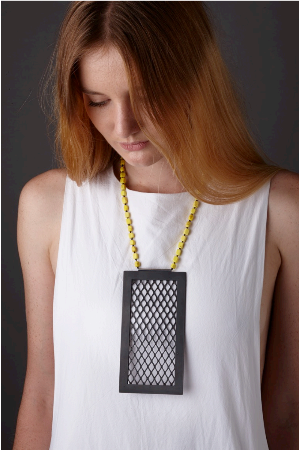
/ Katheryn Leopoldseder. Security Amulet 2013