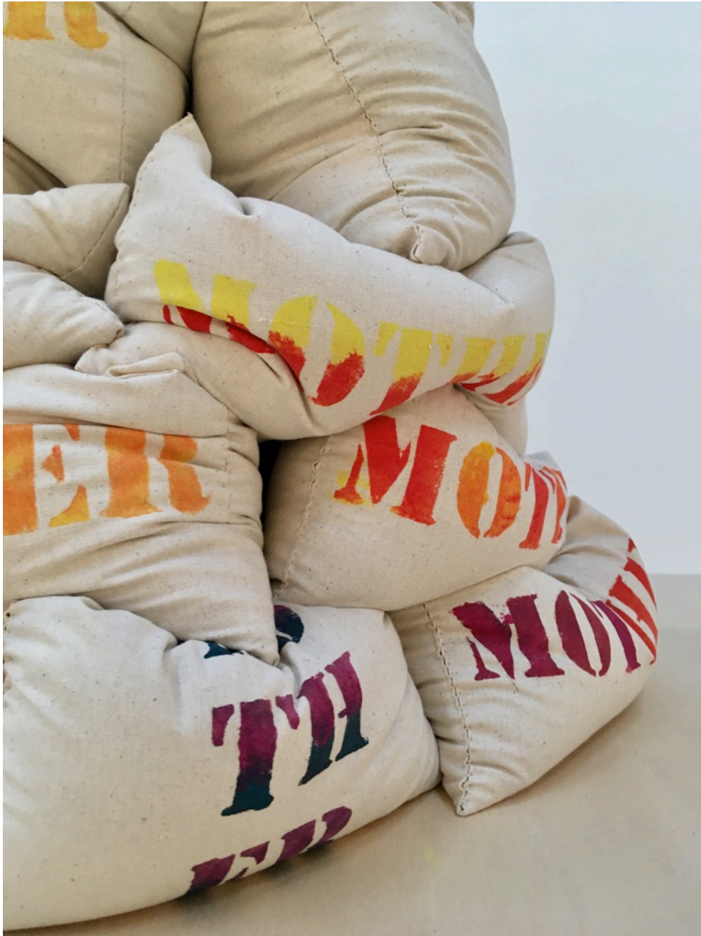
/ Claudia Pharès. Strategies (detail) 2019 © the Artist.