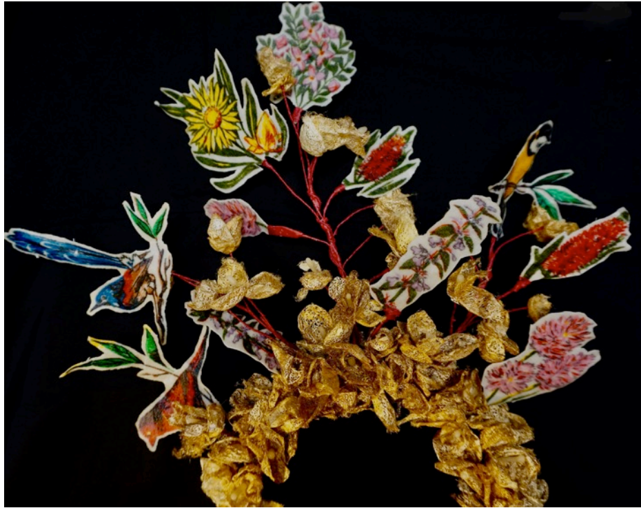
/ Grace Pundyk. Heirloom ('wianek' detail) 2019 © the Artist. Image courtesy of the Artist.