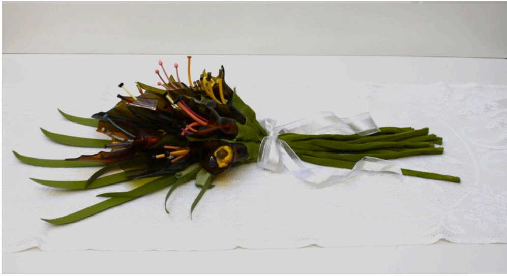
/ Liz Walker. Still Life 2016 © the Artist. Image courtesy of the Artist.