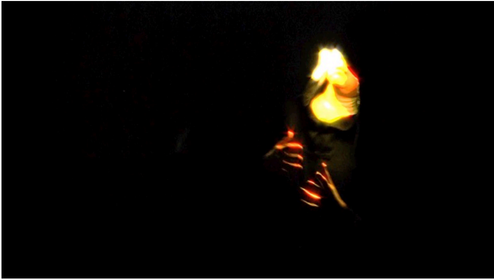
/ Kellie Wells. Ursula's Dance (video still) 2019 © the Artist. Image courtesy of the Artist.