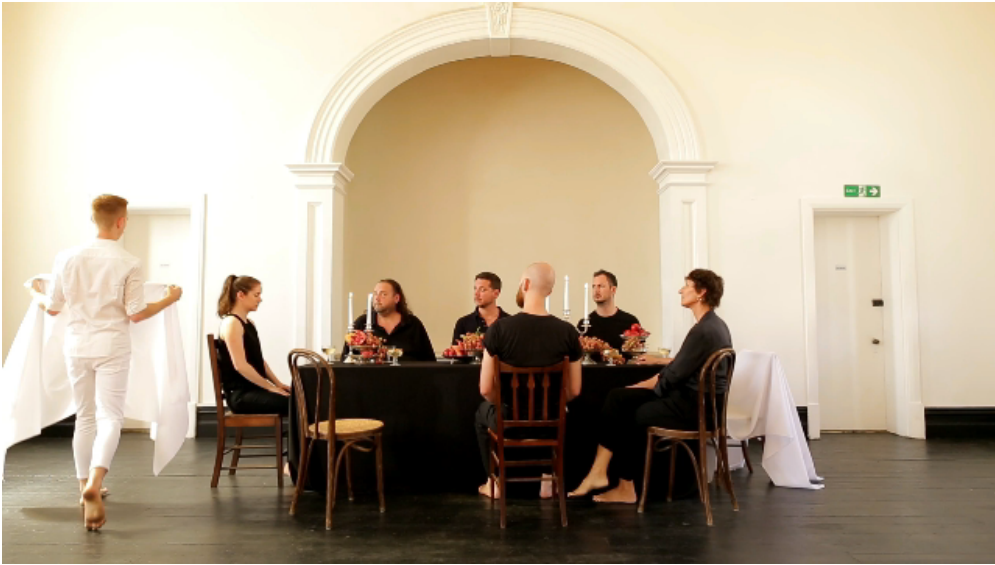
/ Ida Sophia. We Would Sit Together (video still) 2019 © the Artist. Image courtesy of the Artist.