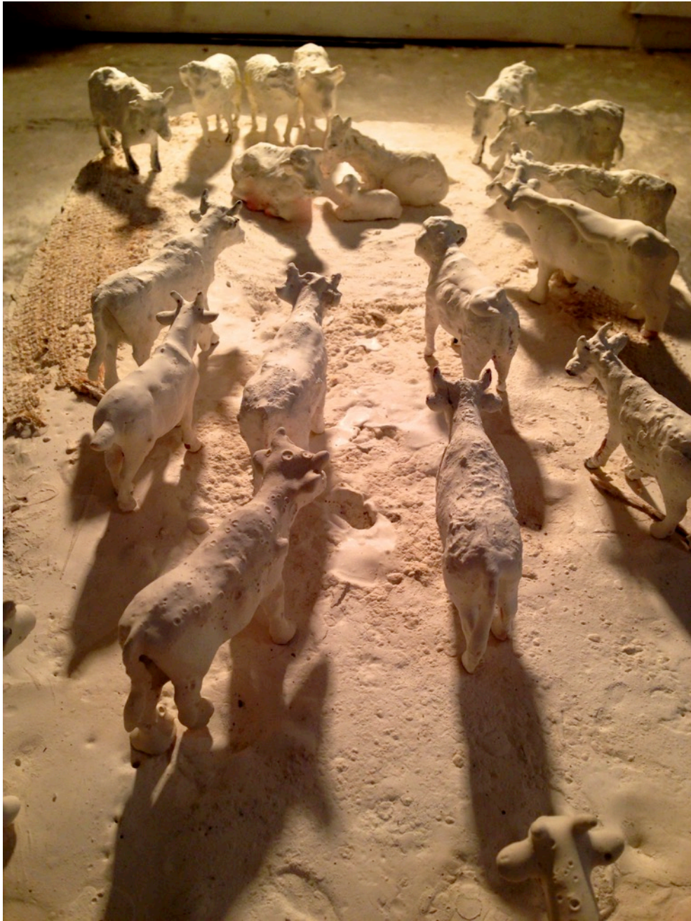
/ Elizabeth Presa. Nativity (detail) 2015 © the Artist. Image courtesy of the Artist.