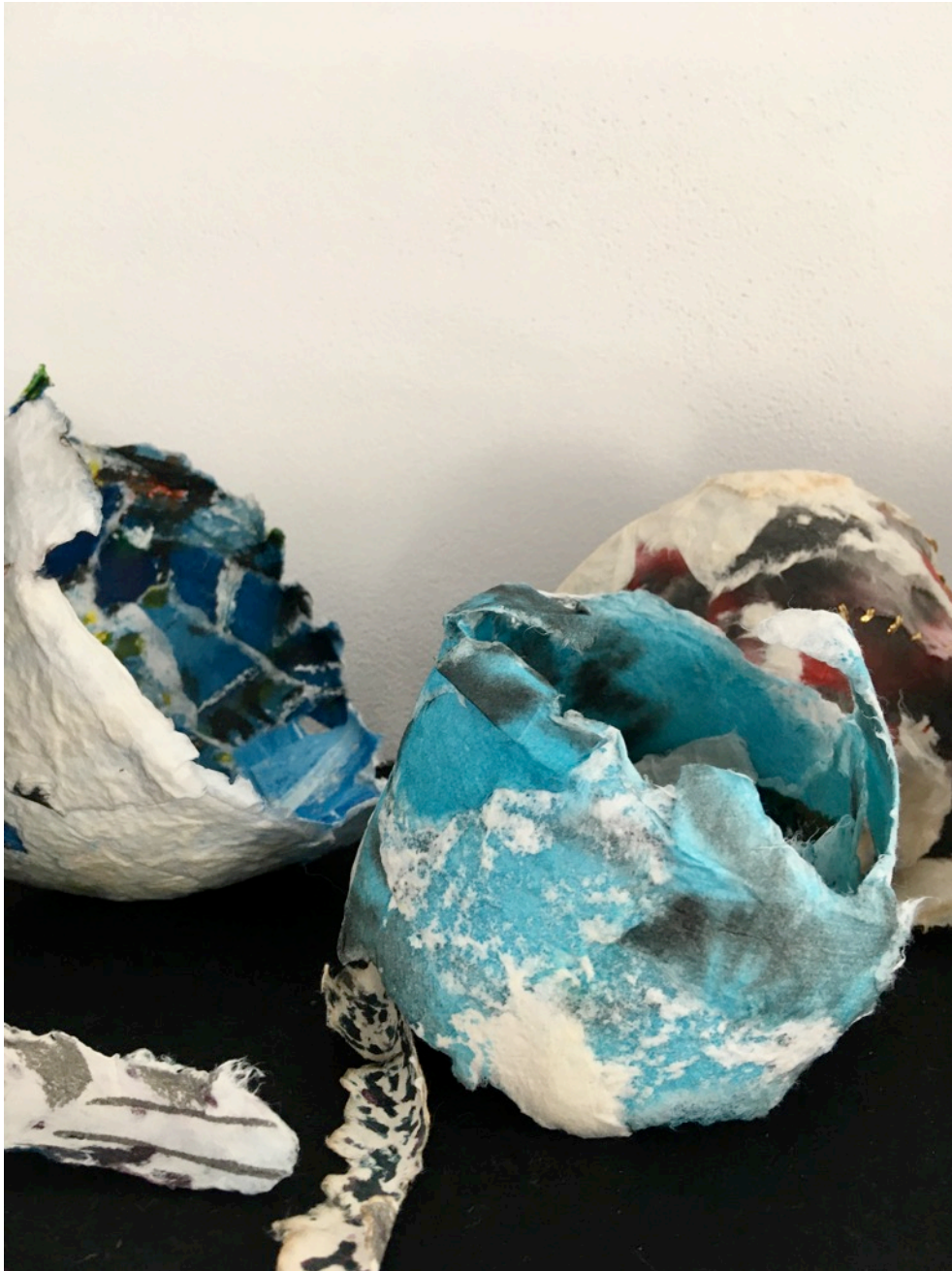
/ Liz Johnson. Vessels of Care (detail) 2019 © the Artist.