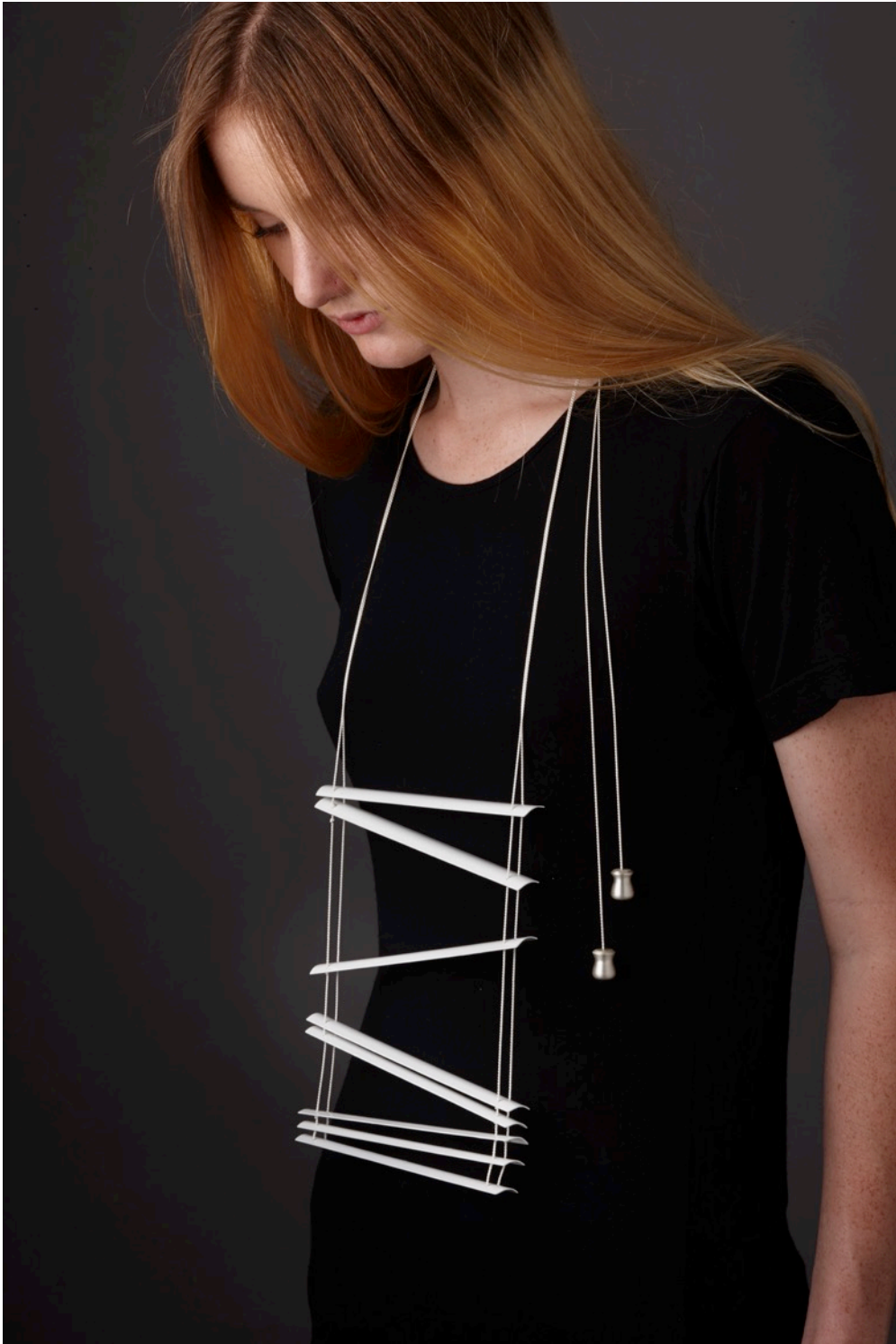
/ Katheryn Leopoldseder. Venetian Blind Tragedy 2013