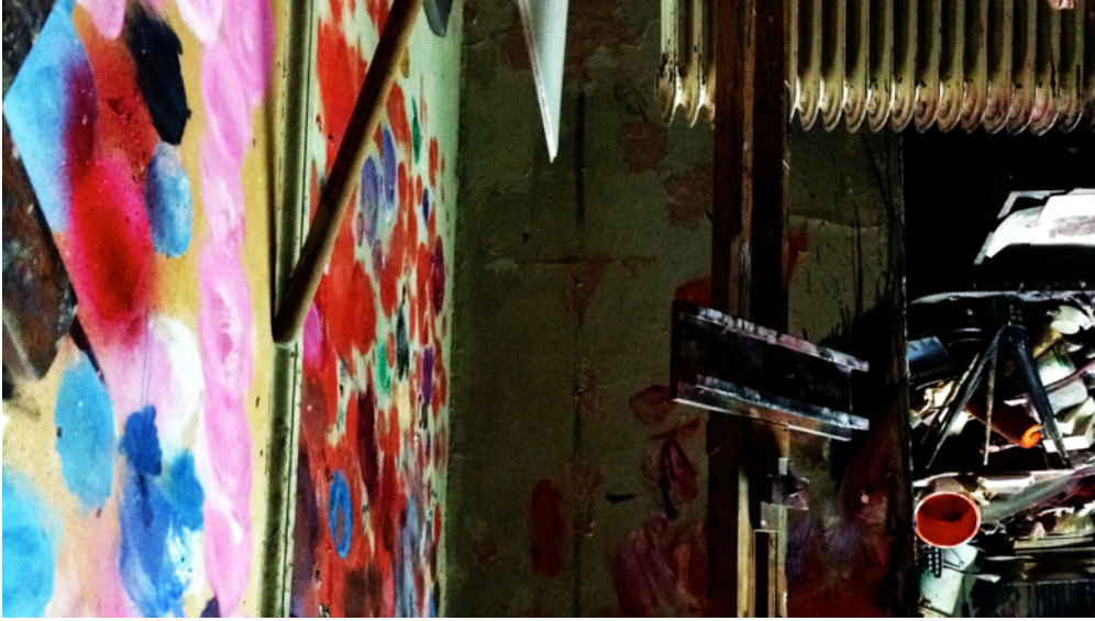
/ Rebekah Pryor. Sealess (video still) 2018