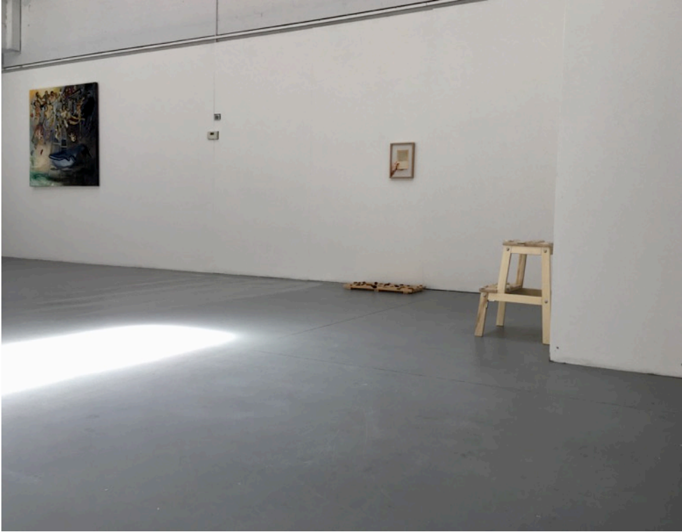
/ Holy, Honest Confluences Exhibition, ACU Melbourne Gallery, Fitzroy, 2019.