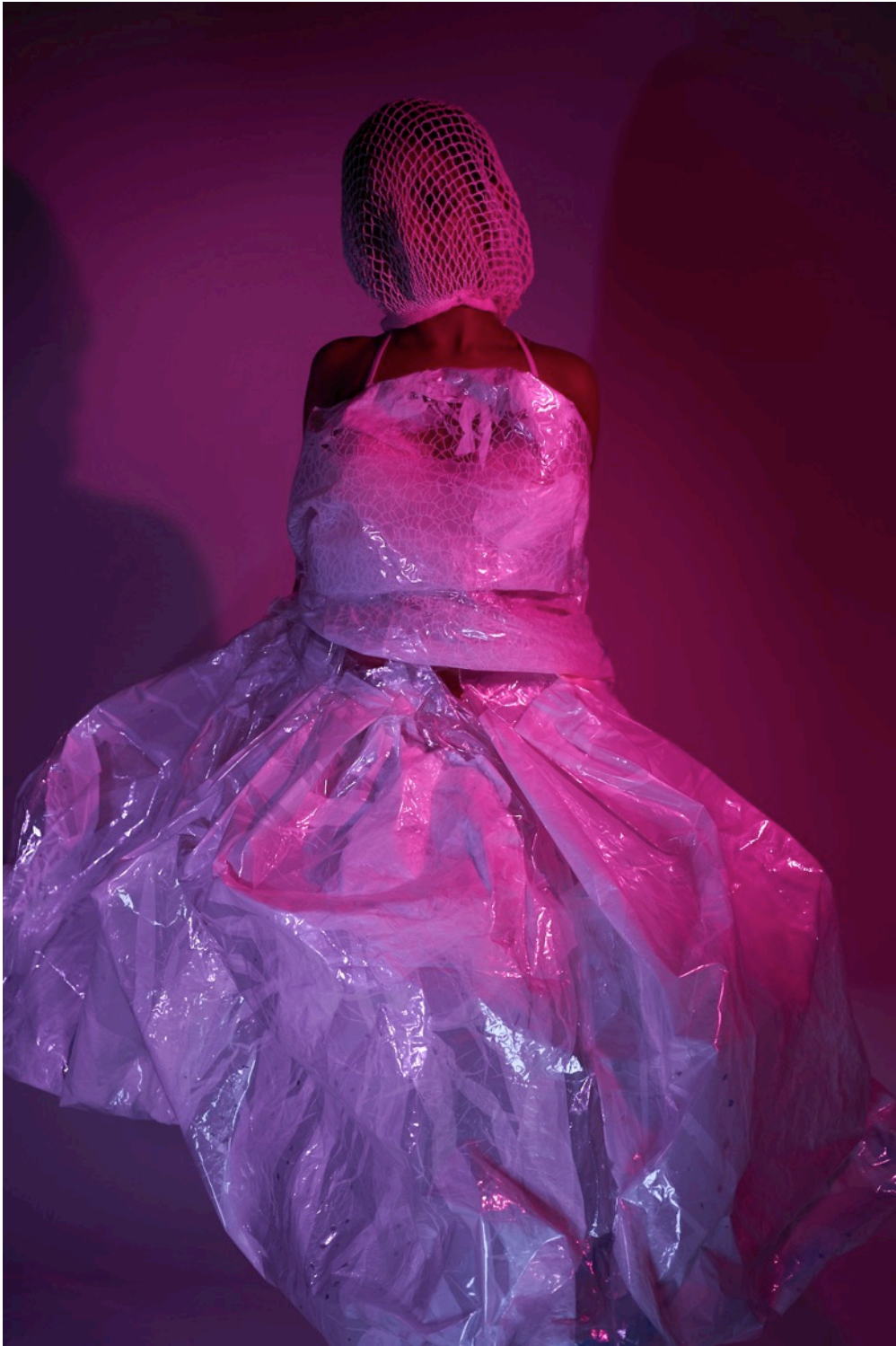
/ Suhasini Seelin & Persia Martel-Cruz. Beauty in Pieces (video still) 2018 © the Artists. Image courtesy of the Artists.