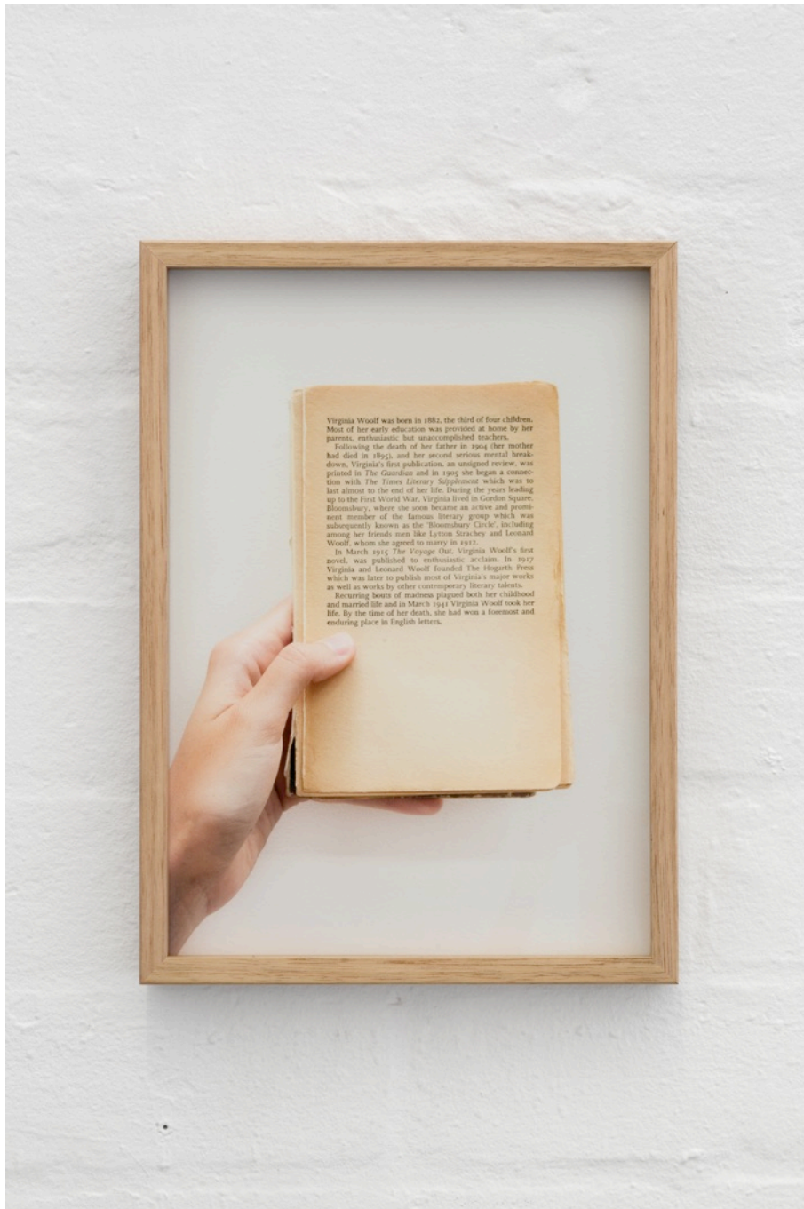
/ Mel Dixon. Measure of Biography (her horizon seemed to her limitless) (detail) 2019 © the Artist. Image courtesy of the Artist.