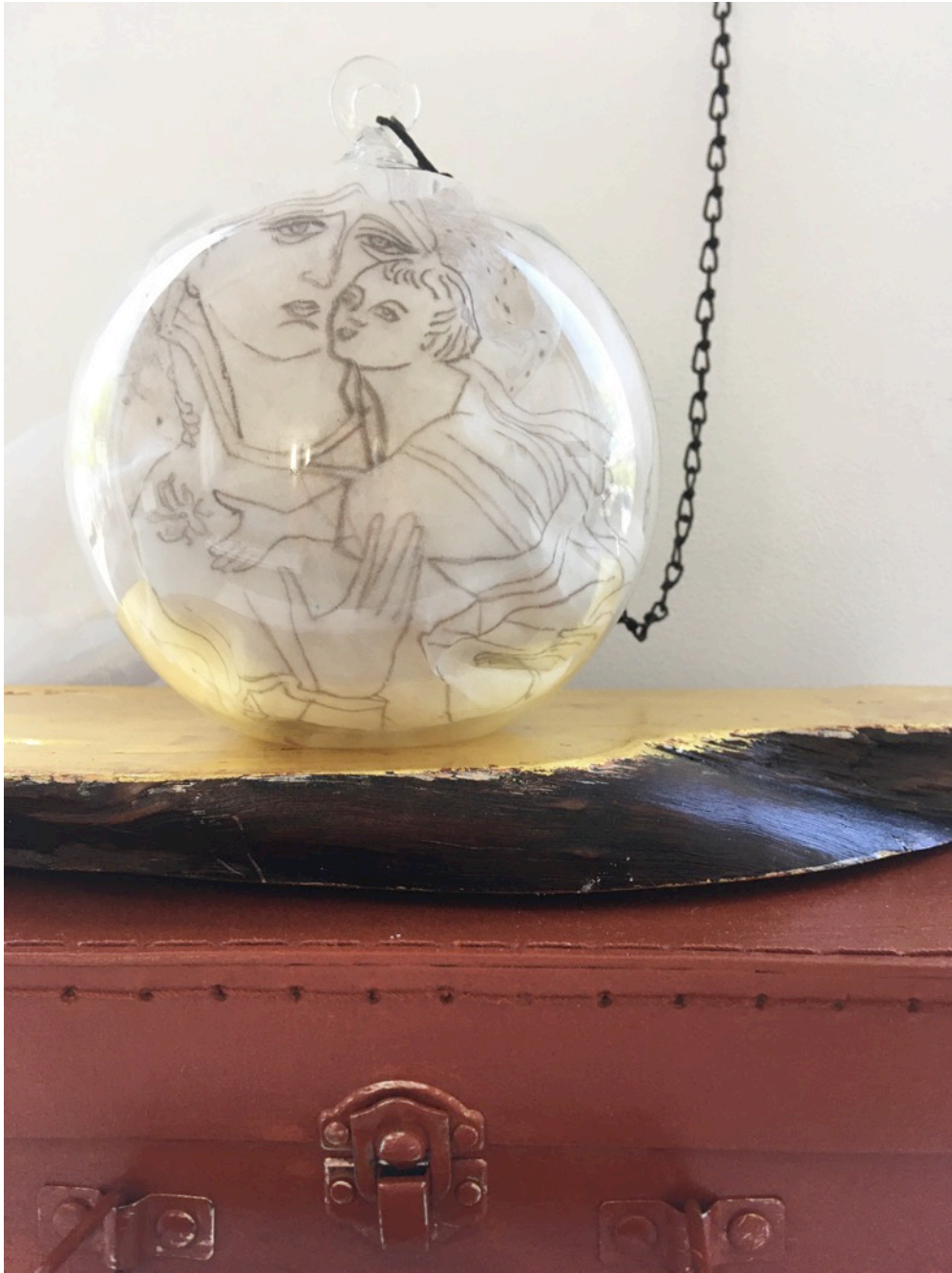
/ Robyn Adler. somethings they leak, everything binds / somethings they bind, everything leaks (detail) 2019 © the Artist.